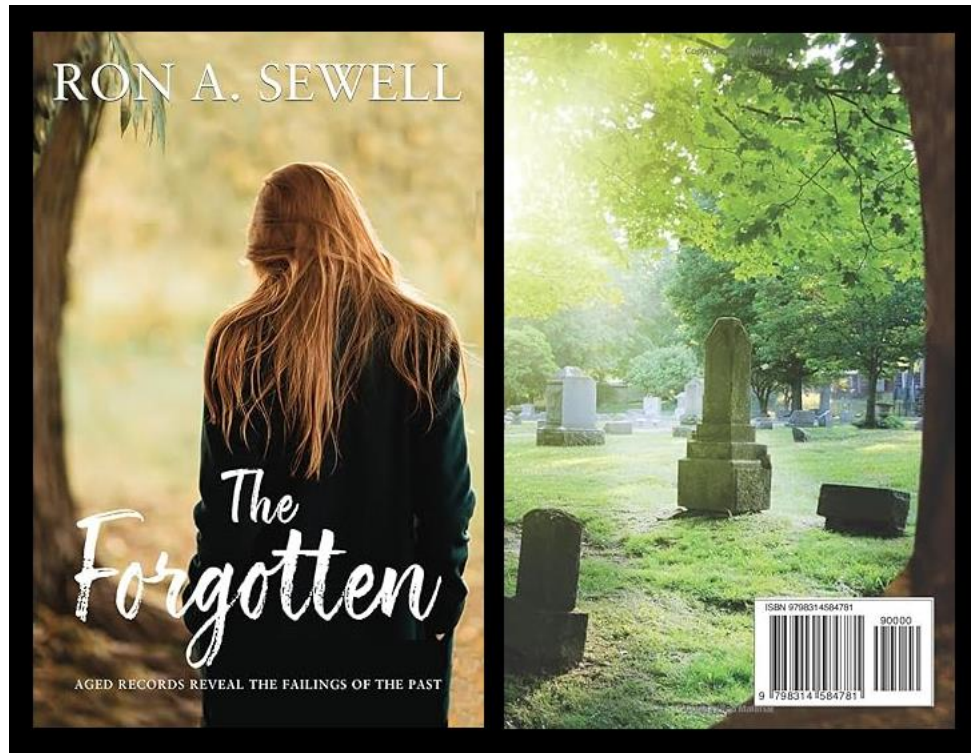
The Forgotten by Ron A. Sewell.

Over 2,000 people go missing in the UK every day. Most are located within twenty-four hours, but for some, no trace of their whereabouts is ever known.