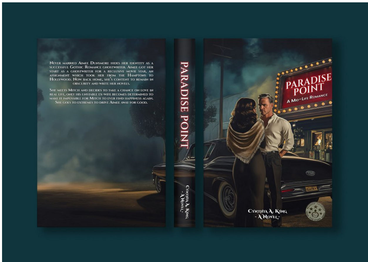
Paradise Point by Cynthia A. King

https://www.amazon.com/Objection-My-Affection-Later-Life-ebook/dp/B0DCQSMZM/ref=tmm_kin_swatch_0#customerReviews