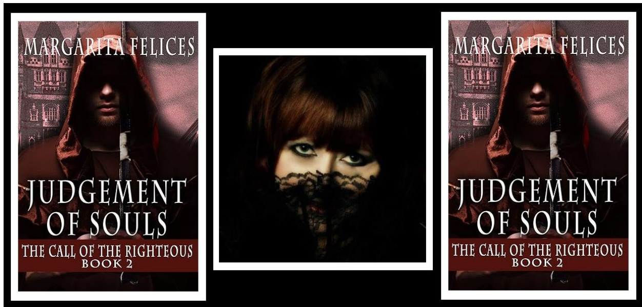
The Call Of The Righteous by Margarita Felices

https://www.amazon.com/product-reviews/1539549844/ref=acr_dp_hist_5?ie=UTF8&filterByStar=five_star&reviewerType=all_reviews#reviews-filter-bar