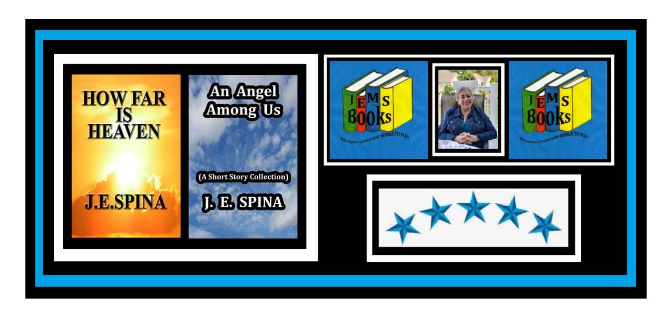
Special Two Book Collection For Ages 18+ by Janice Spina