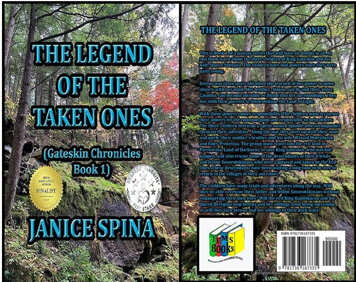
The Legend Of The Taken Ones by Janice Spina.