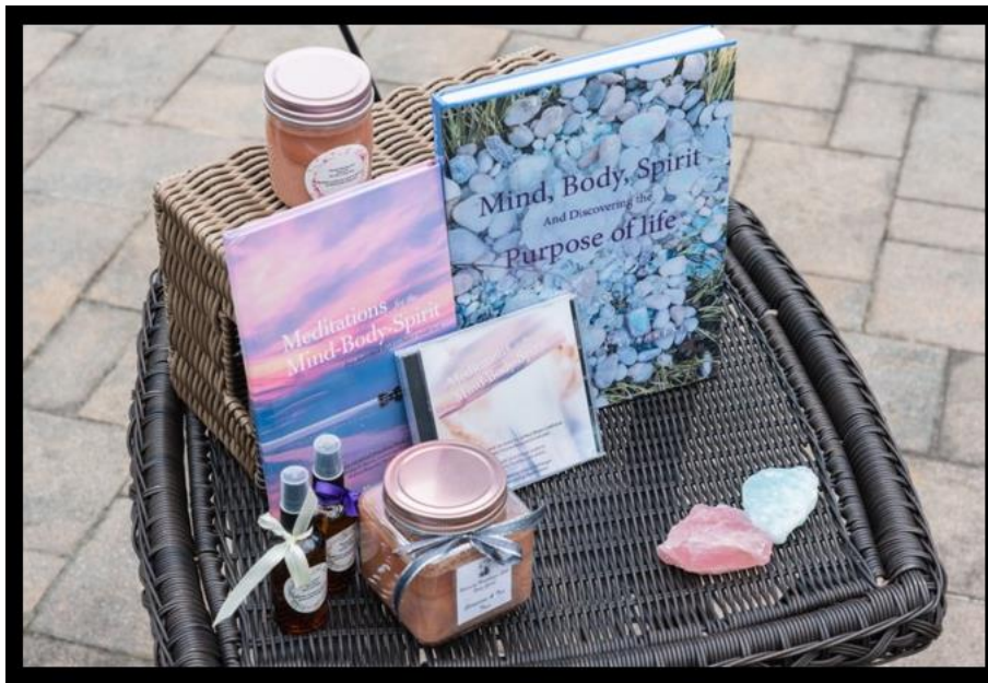
Guided Meditation With Diane