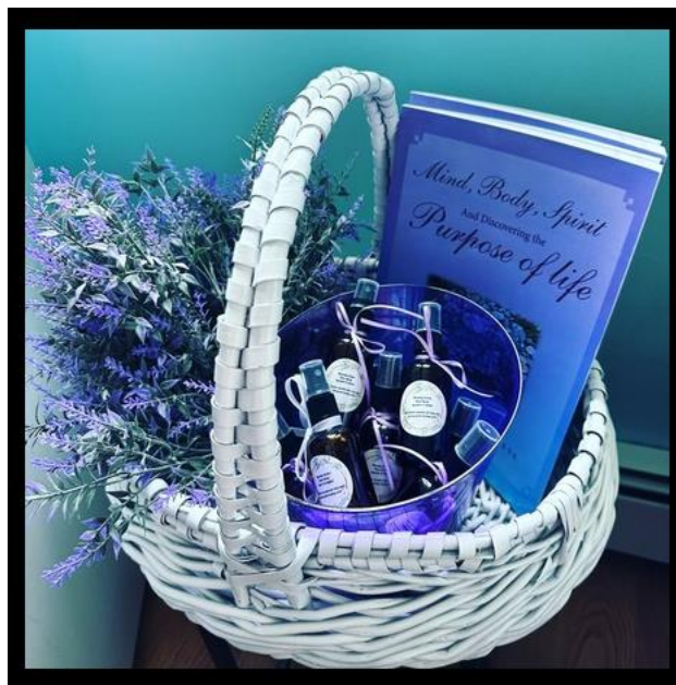
How To Safely Use Aromatherapy With Diane