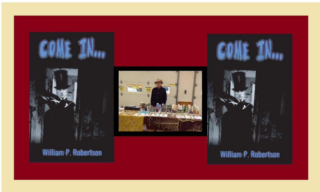
Come In...